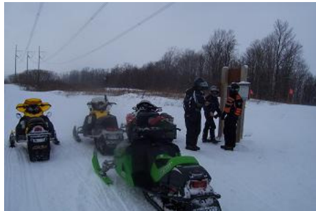
Junction of C7B and C7F

Now continuing on north along C7B you will climb a hill and then leave Frontier's trail system. This next area used to be maintained and part of