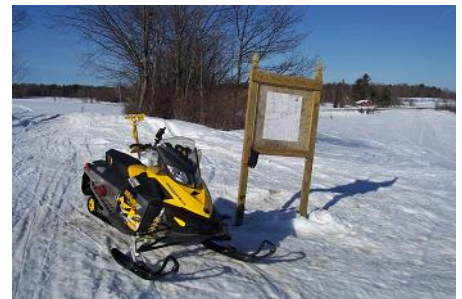
Junction of C7B and C7E

Just under a mile and you will reach the junction with C7B. This is a good place to check the kiosk and see where we have ridden.