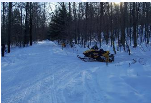
Junction of S70 and C7B

We start our journey at Jonathan's in Duaneburg. This is a good launch site as it is just off I-88 and up the hill a couple of miles from the Thruway. You will want a full tank before starting out as it will be a long way before the next fuel stop. There is a Stewart's across the street to handle your fueling.