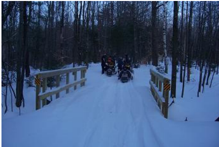
Charleston S.F. bridge

After traveling a number of miles, you will come upon an intersection for a local trail heading west to Charleston Four Corners. Staying on C7E you will come out of the woods into a field and then see another intersection. Turning right on this local trail will take you down to Sloansville. There is a Mobilmart there with food and fuel available. If you were to continue west from Sloansville, you would be leaving Frontier and entering Cave Country on C7F.