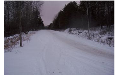
Looking up Cooley Heights

20 bridge. On the east side you will find a Stewart's Shop and the Hillview Tavern. Good food and fuel will keep you going.