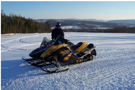
Looking south from above Sloansville

Now then, heading back up to C7E take a right to head to Esperance. The trail winds its way downhill through the out skirts of the village then quickly crosses the Schoharie Creek on the US Rt