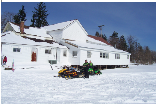
Mariaville Country Store

After crossing Batter St. you will come to an intersection, a local trail turns right and will take you into Mariaville. You can grab a bite to eat at the County Store.